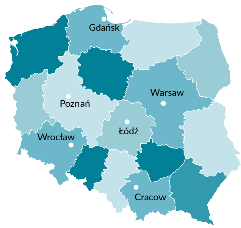
GRAPH 1. POLAND IS DIVIDED INTO 16 ADMINISTRATIVE REGIONS WITH THE CAPITAL CITY OF WARSAW